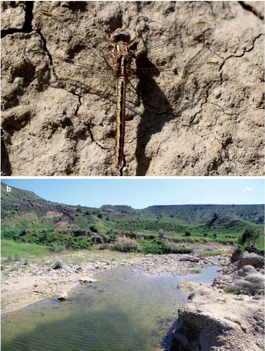
Figure 3. Freshly emerged female of Orthetrum taeniolatum perching on the ground (a); Kalkanli (Kalo Chorio), Çiftlik stream (b), Cyprus (09-iv-2012). – Abbildung 3: Frisch geschlüpftes Weibchen von Orthetrum taeniolatum auf dem Boden sitzend (a); Kalkanli (Kalo Chorio), Fluss Çiftlik (b), Zypern (09.04.2012).