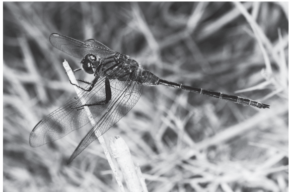
Figure 2: Orthetrum trinacria, mature male, Turkey, Şanlıurfa, Birecik (11-x-2010). – Abbildung 2: Orthetrum trinacria, reifes Männchen, Türkei, Şanlıurfa, Birecik (11.10.2010).