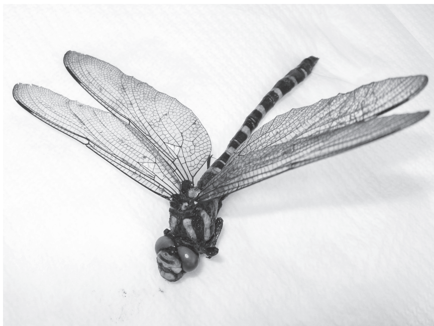
Figure 2: Female of Cordulegaster heros found dead on 19-viii-2009 in the Buchlovický stream near Buchlovice, the first record of the sp. for the Czech Republic. – Abbildung 2: Weibchen von Cordulegaster heros, Totfund am 19.08.2009 im Buchlovicer Bach bei Buchlovice, Erstnachweis der Art für die Tschechische Republik.

The specimen was found at the end of the flight season of Cordulegaster heros , when adults on the wing are usually rare. The female's body was floating in water lifelessly, however its eye colour corresponded to that of living individuals, i.e. bright green. Hence, at this time the specimen can not have been dead for a long time (Fig. 2). The specimen was discovered under a small bridge in a section of