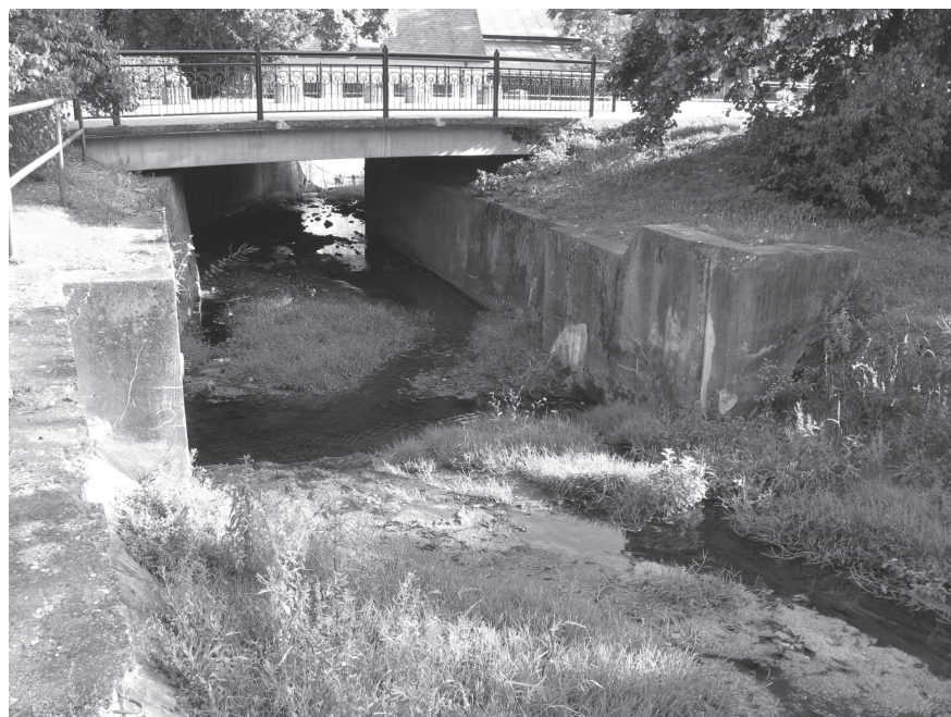
Figure 3: Buchlovický stream, Buchlovice, Czech Republic, recording site of the dead female of Cordulegaster heros (21-viii-2009). – Abbildung 3: Buchlovicer Bach, Buchlovice, Tschechische Republik, Fundort des toten Weibchens von Cordulegaster heros (21.08.2009).